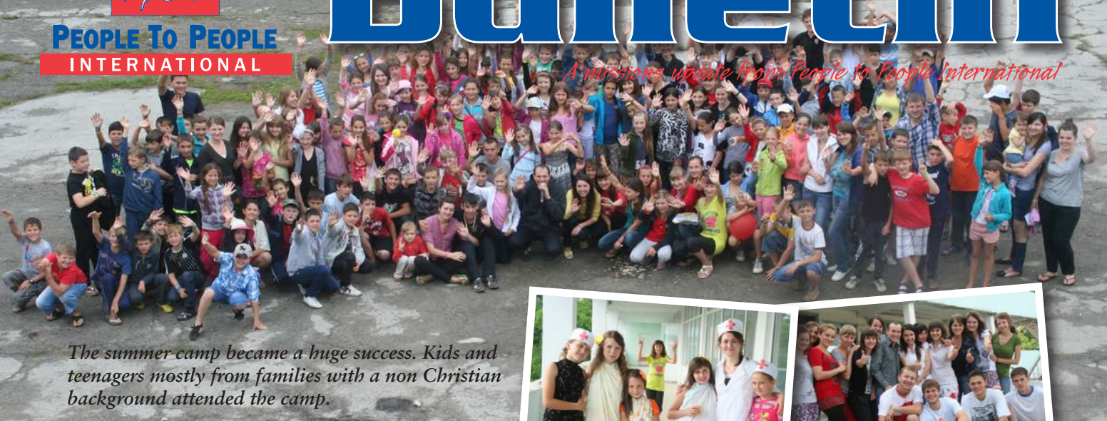
The summer camp became a huge success. Kids and teenagers mostly from families with a non Christian background attended the camp.

A mission's waste from People to People International