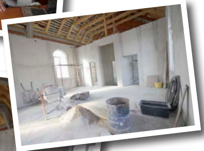
The Church in Spinus. Interiour walls now plastered. Soon floor and roofing will be in place.